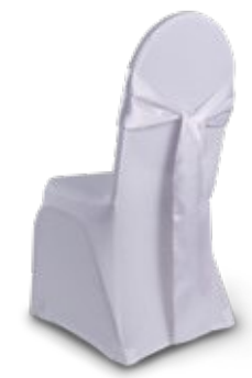
Fitted design with sash