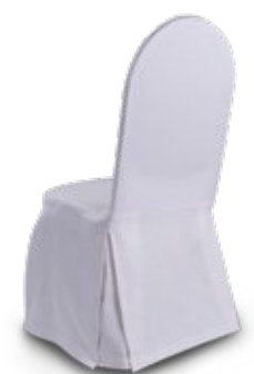
Loose design with twist pleat corner