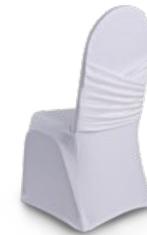
Fitted design with cross back