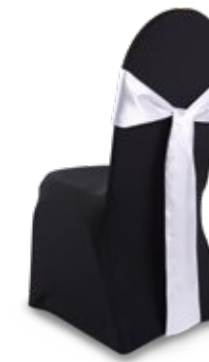
Fitted design with sash